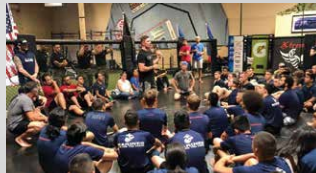
The Huddle session after MVP training at Xtreme Couture MMA