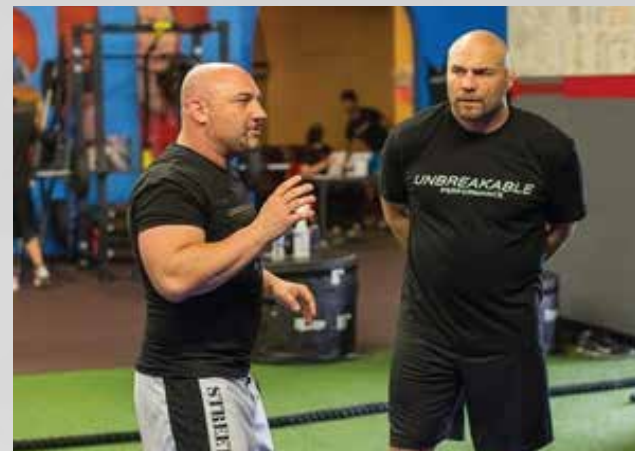
Randy Couture and Jay Glazer at leading a MVP training workout.